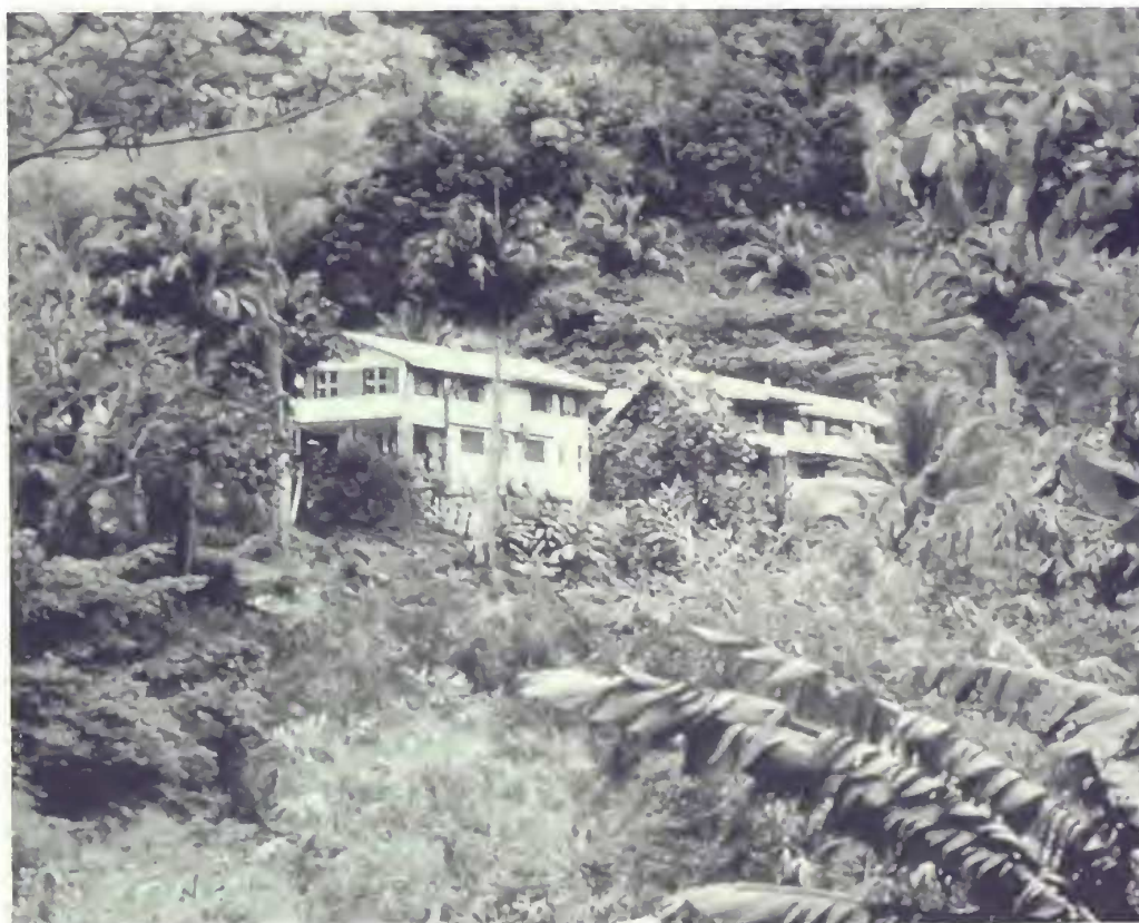
Figure 2. View of the Springfield Estate, St. Paul Parish, Dominica.

Ectoparasites found on Monophyllus included Nycterophilia coxata Ferris and Trichobius truncatus Kessel, batflies of the dipteran family Streblidae.